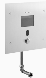
Variation Not Shown: Less Box